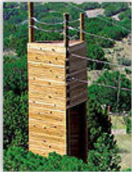
The new 35 foot Climbing Tower is perched on the edge of a box canyon.

Older Scouts/ Adults will enjoy the new C.O.P.E course.